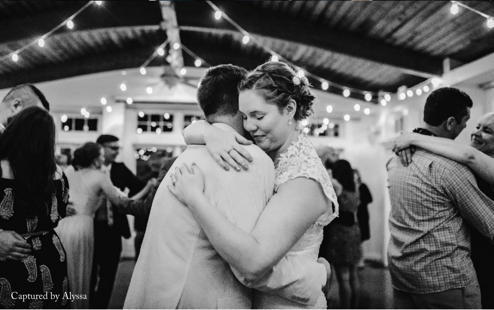
Captured by Alyssa