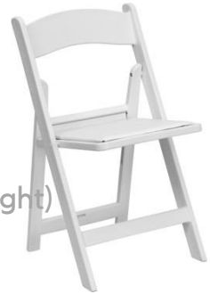
Ceremony and reception chair